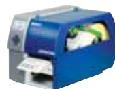
BP-PR PLUS Series