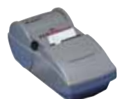
TLS PC Link™ Thermal Labeling System